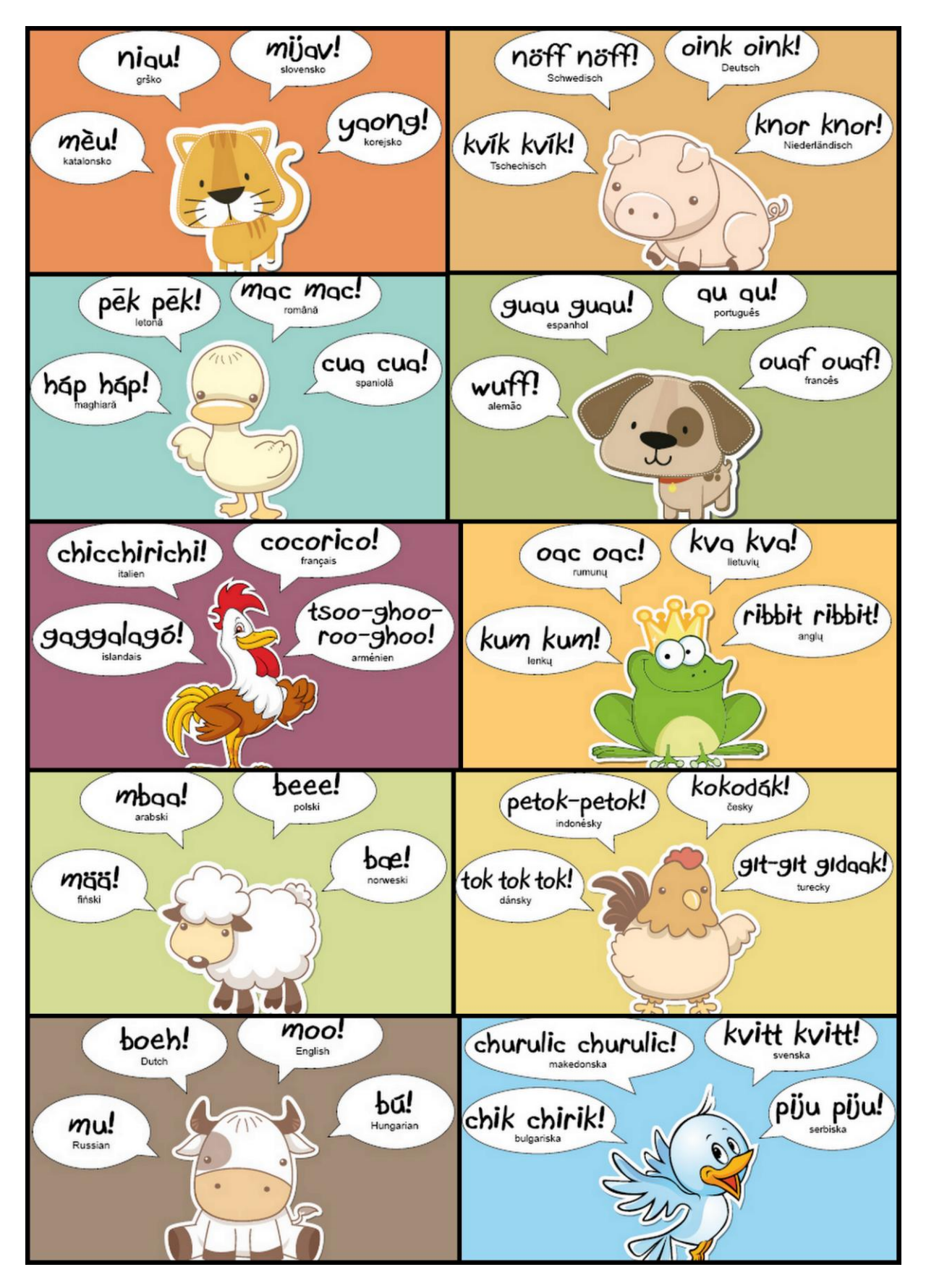
Potom kreslili svoje obľúbené zvieratká, ktoré si navzájom zdravili v jazykoch, ktoré ich zaujali.